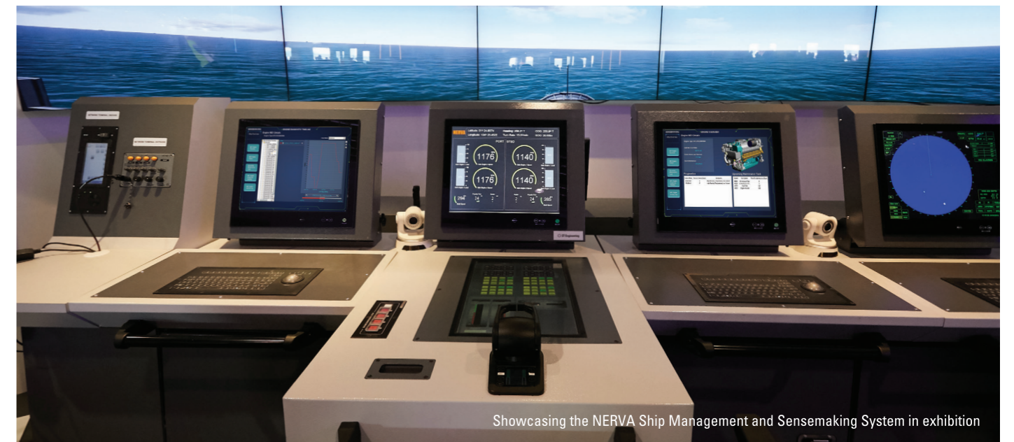
Showing the NERVA Ship Management and Sensemaking System in exhibition

The sensemaking system is further enhanced with a decision support engine which provides recommendations in preventive actions to the operator. This allows a condition-based maintenance approach which will reduce downtime and maintenance costs.